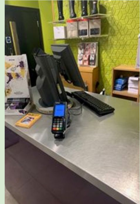
What a cash desk at schuh might look like