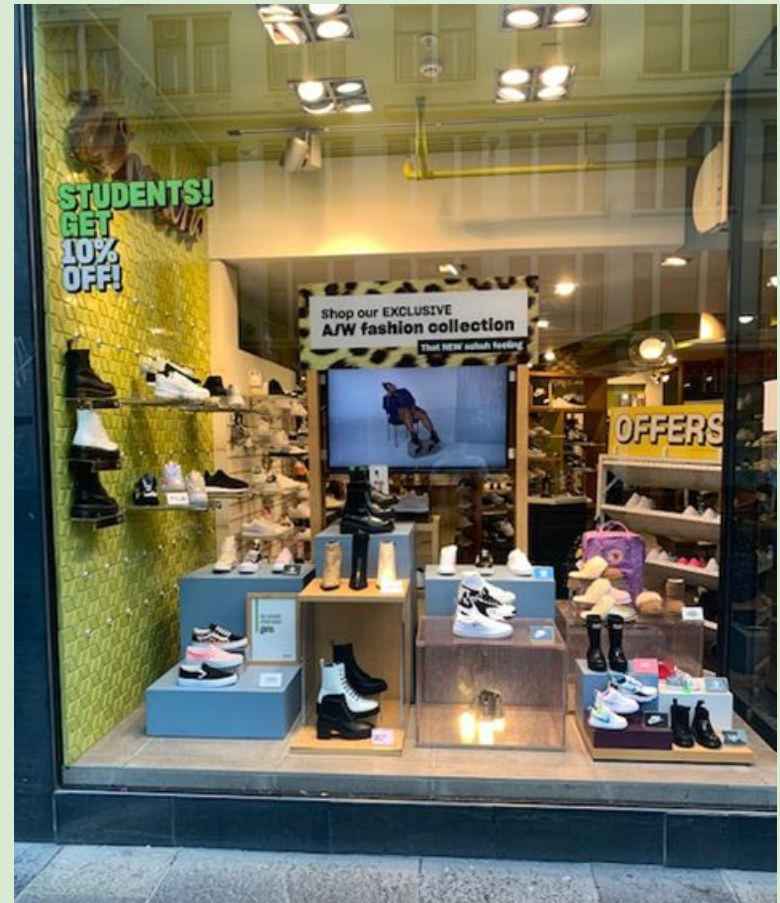
What a window display at schuh might look like

If I decide to go inside, the sales advisors will often greet me with a friendly smile and say hello - they wear bright green lanyards, so they're easy to spot. They can help with things like measuring my feet, picking a pair of shoes or showing me where my favourite shoes are.