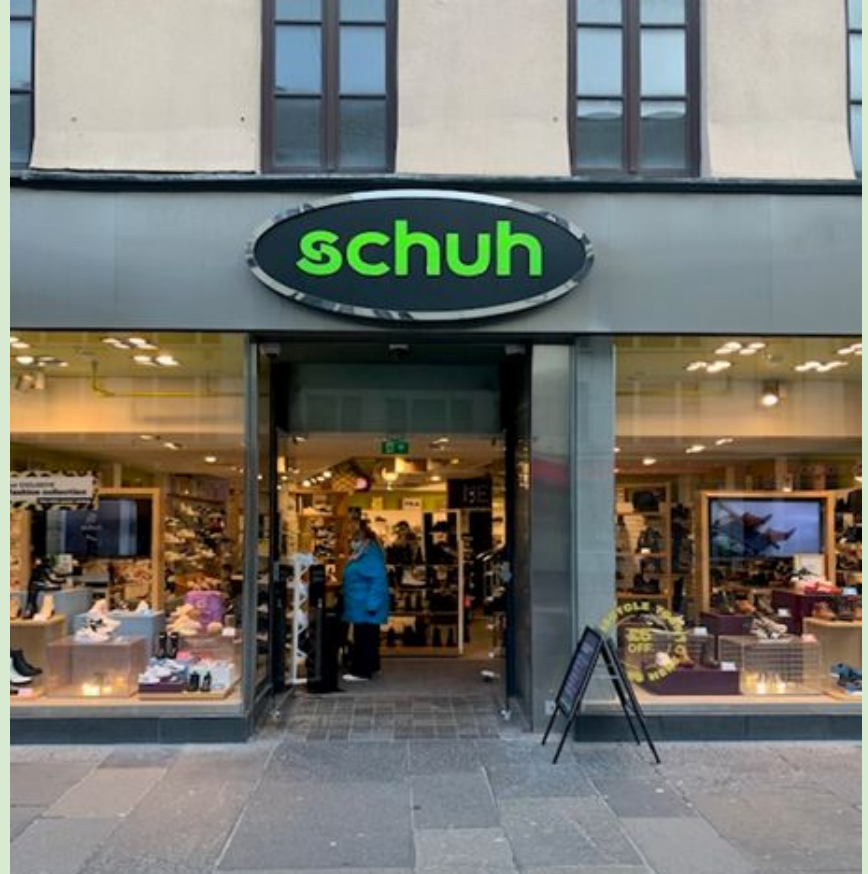
What a schuh store might look like

There will be music playing in store which I can ask to be turned down if I think it's too loud. There are bright lights in store too and I can ask where the dimmer lit areas of the store are.