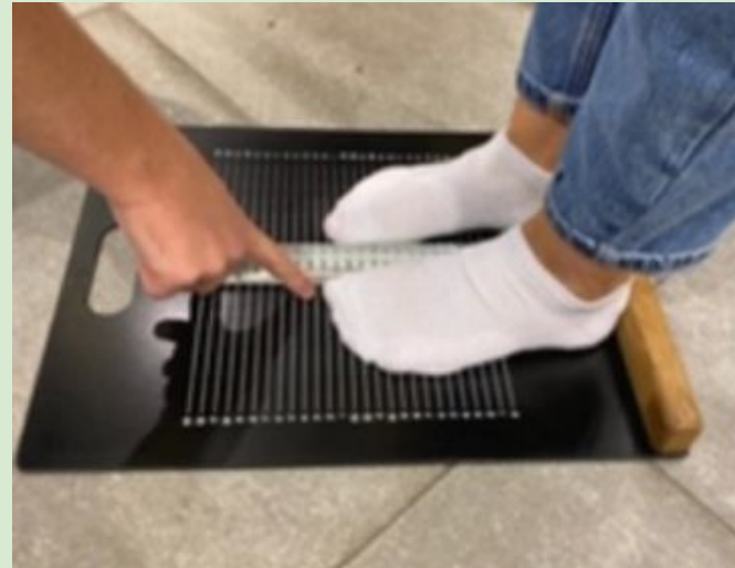
What the measuring board might look like