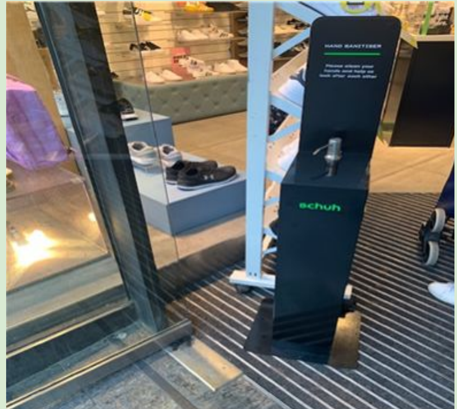
Hand sanitising station at schuh

I'll see a hand sanitising station at the front of the store which I can use if I'd like. I will also see people wearing face masks and keeping their distance from me - this is nothing to worry about and is just something they have to do to keep me safe.