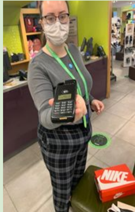
Card machine at schuh

We'll be asked if we'd like a bag for my shoes and we'll also be asked if we'd like a paper receipt or an email receipt.