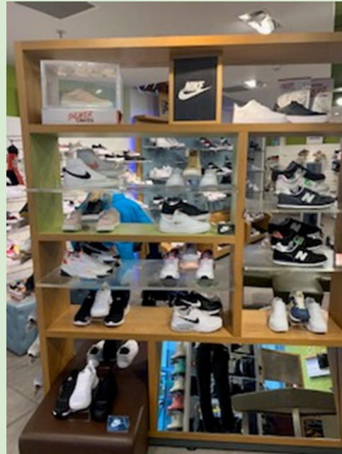
Footwear displays at schuh

When I've made my decision, I can let them know and they'll go and get my shoes from the stockroom in the correct size.