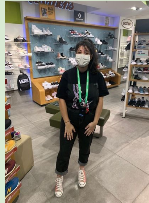
Sales advisor wearing a green lanyard